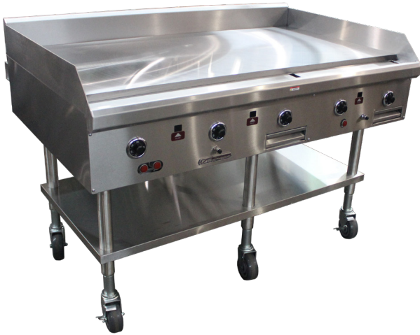
Model shown HDG-60-30 shown with optional stand and casters